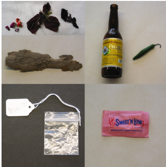
Figure 1. A selection of tangible objects collected by participants in the festival study. “The flowers (upper left) ... mirror how I think about jazz.”

with structured, question-and-answer based annotations. Our studies also revealed the usefulness of different media in different situations. Specifically, we found that images lead to more specific recall than any other medium, but that audio, in addition to making it easier for participants to capture information that does not have a visual representation, can be used clandestinely in situations in which participants do not feel comfortable using a photo to capture an event. We found that information about location does not significantly impact recall, and that tangible objects are more likely than other media to prompt discussion of broad attitudes and beliefs (Figure 1). We also noticed unforeseen issues in elicitation interviews. For example, while media capture lent itself to a sequential review of data, interview discussion tended to follow themes, causing problems for participants and researchers when they referenced captured data out-of-sequence.